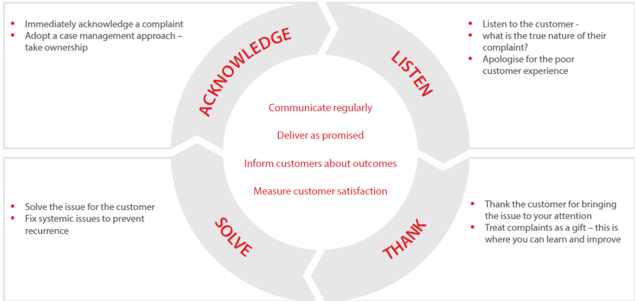
Source: Customer Quotient - Government of South Australia – Service Recovery Model http://servicesauat.share.sa.gov.au/CQServiceExcellence/Pages/Service-Recovery-Model.aspx

Together with TAFE SA’s core values and service charter, the service recovery model below demonstrates good practice concerning service recovery principles adopted by the government. Where a matter cannot easily be resolved or requires a coordinated response staff will be supported through a similar process by the TAFE SA Customer Management team in accordance with the Complaint Management Framework (refer procedure document for specific process information).